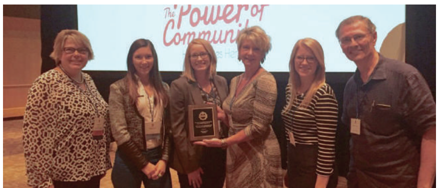
Vail Place receives 2018 MACMHP Program Innovation and Community Collaboration Award.

Our partnerships are also creative. Take our collaboration with the History Theatre for our Theater Arts Program – members learn the power of the arts and creative expression for recovery as they develop personal stories that serve as the basis for many outreach presentations.